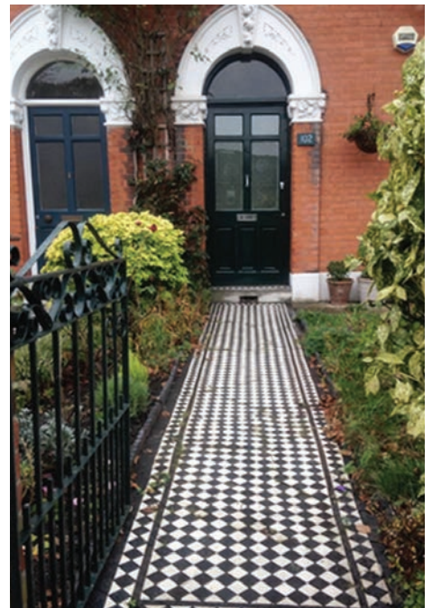
CORBETT ESTATE HOUSE DOORWAYS

Help us to all develop the estate into a vibrant area that owns and supports its community, recognises its historical legacy and creates a strong future identity for the Estate.