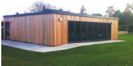
CEDAR-CLAD MODULAR BUILDING

After three years...of negotiations with the Council, Community Teachsport, a local community interest company, has finally signed a 25 year lease at a peppercorn rent to manage the Abbotshall Road Playing Field on the understanding it regenerates the playing surface and replaces the existing pavilion and changing rooms with a new community Healthy Lifestyles Centre. The plans shown give an idea of the layout of the ground and the style of the modular building, which will be mainly clad in cedar.