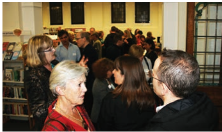
CONSULTATION MEETING AT TORRIDON ROAD LIBRARY

Love Corbett is a website that is operated by Commonplace on our behalf that allows you to have your say about what you love or don't love about the Corbett Estate. It has been set up as part of our Neighbourhood Forum project to collect information from residents living on the Corbett estate and help us create a Neighbourhood Plan for the estate which becomes a legal document that Lewisham Planning have to consult when assessing planning applications and how the estate should be developed in the future. It is very important that you have your say. Just click Love Corbett on www.corbetsociety.gov.uk , fill in a few details and click on 'post comment'. You can make as many comments as you like.